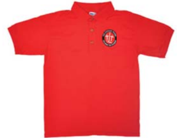
Red Sports Shirt