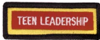
TLT Sleeve Strip