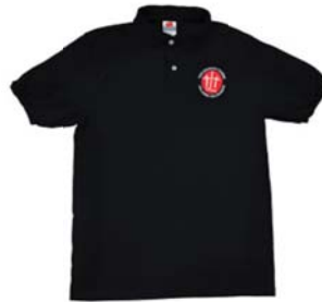
Black Sports Shirt